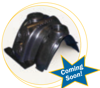
Side Port Coupler