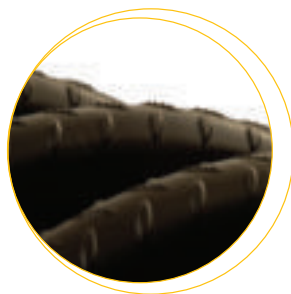
Diamond Plate Texture