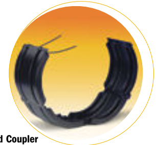
8" - 24" Split Band Coupler