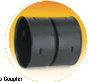
4" - 10" External Snap Coupler