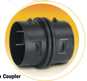
3" - 8" Internal Snap Coupler

All sales of Hancor product are subject to a limited warranty and purchasers are solely responsible for installation and use of Hancor products and determining whether a product is suited for any specific needs. Please consult a full copy of Hancor's Terms and Conditions for Sale for further details.